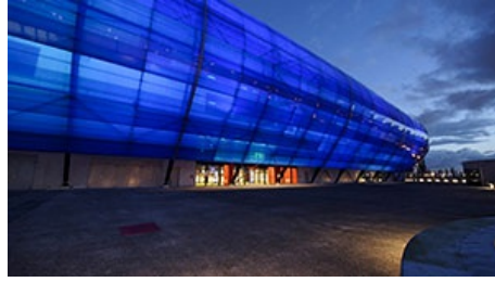
What we do?